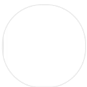
Solid surface white 3mm X035